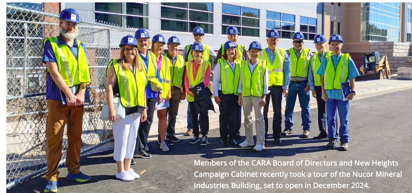
Members of the CARA Board of Directors and New Heights Campaign Cabinet recently took a tour of the Nucor Mineral Industries Building, set to open in December 2024.