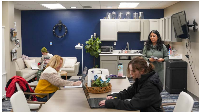
The Women in Science and Engineering program, located in the Surbeck Center.